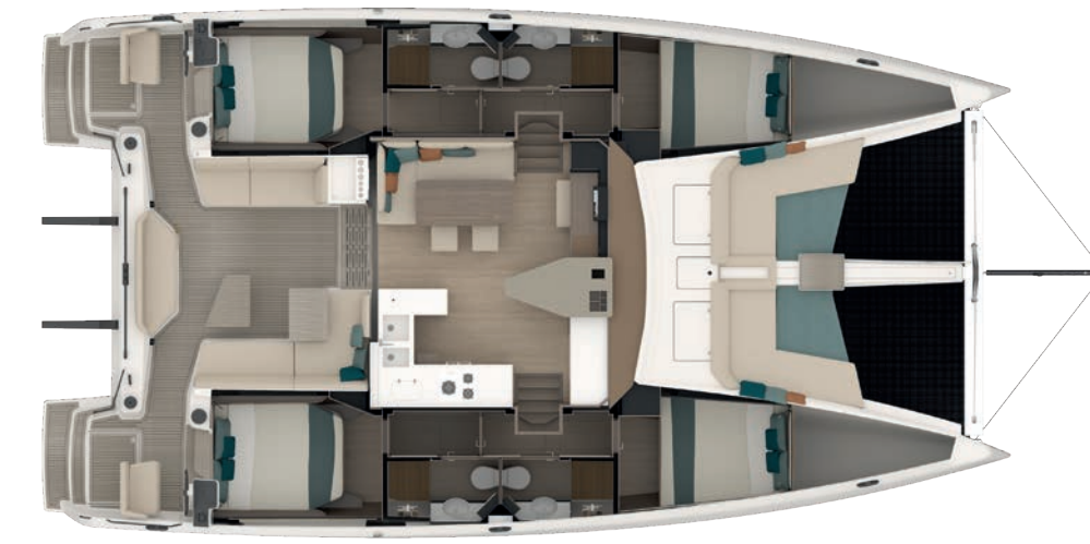
4 cabines, 4 heads