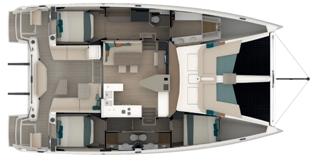
3 cabines, 3 heads, owner suite