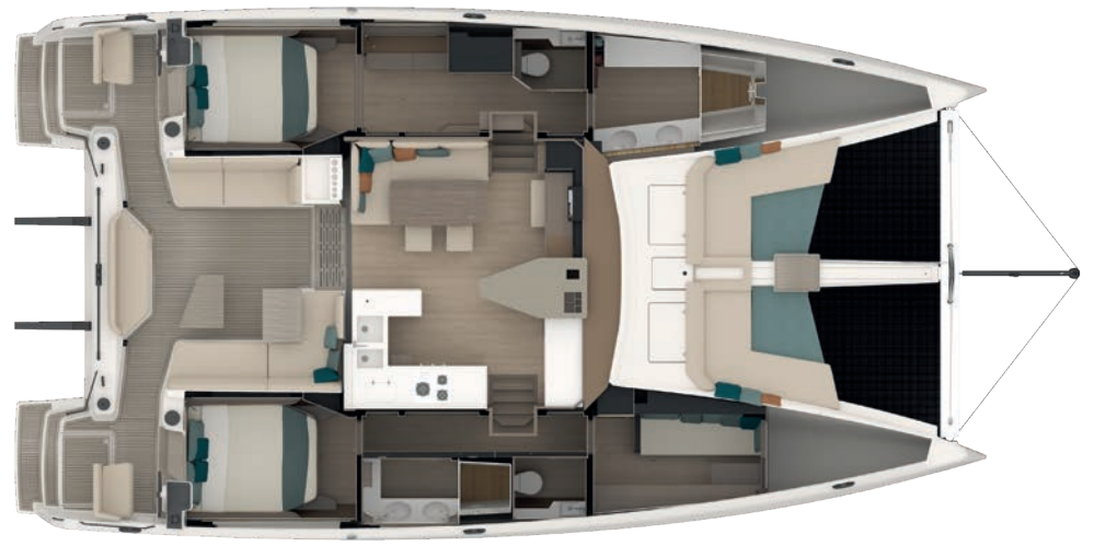
2 cabines, 2 heads + Smartroom® FLEXIBILITY